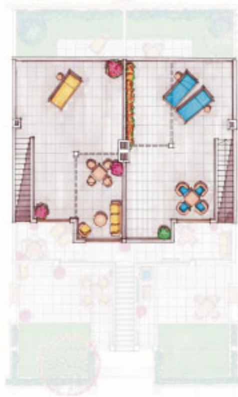
TOP FLOOR / SOLARIUM TERRACE